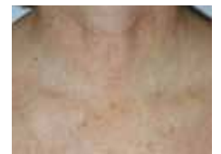
One month post 1 treatment