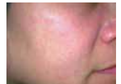
Post 1 treatment