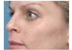
Post 5 treatments